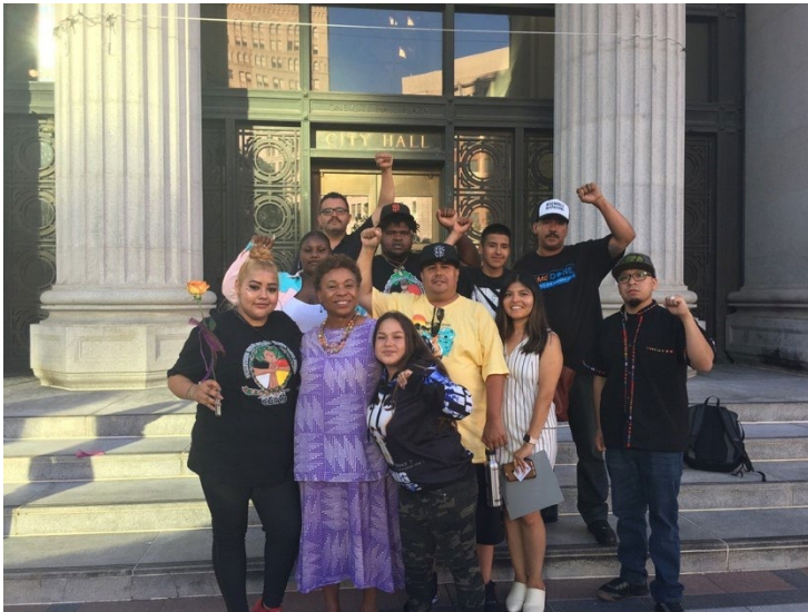
Leadership Development Program

For maps of projected program locations, click here