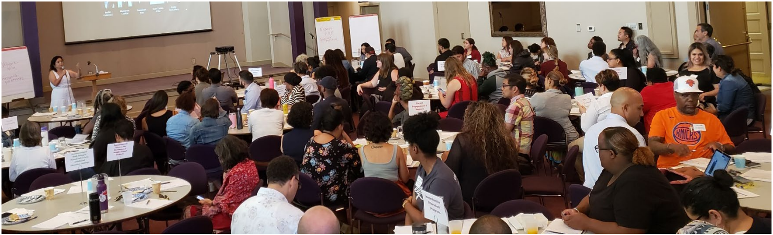
September Grantee Convening at Nile Hall